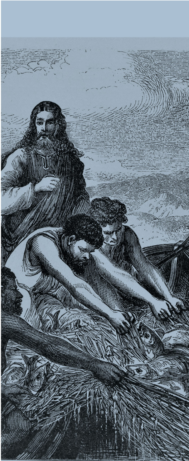
A MULTITUDE OF FISHES.

STUDY This week, look up the feast days and read about the saint of the day. What can we learn from their example?